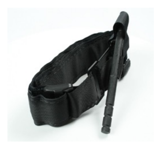
Figure 1: Combat Application Tourniquet