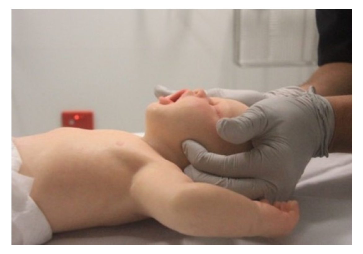
Figure 3: Jaw thrust in an infant