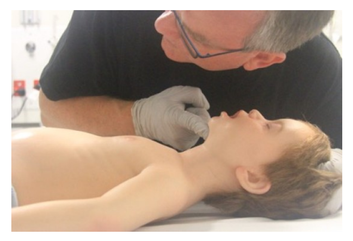
Figure 5: Look, listen and feel assessment

The patency of the airway may be assessed by observation of movement of the chest and abdomen during breathing (LOOK), listening for breath sounds from the mouth or nose (LISTEN), and feeling for air movement on the rescuer's cheek (FEEL) (Figure 5). An indrawing of the chest wall and/or distension of the abdomen with each inspiratory effort without expiration of air implies an obstructed airway.