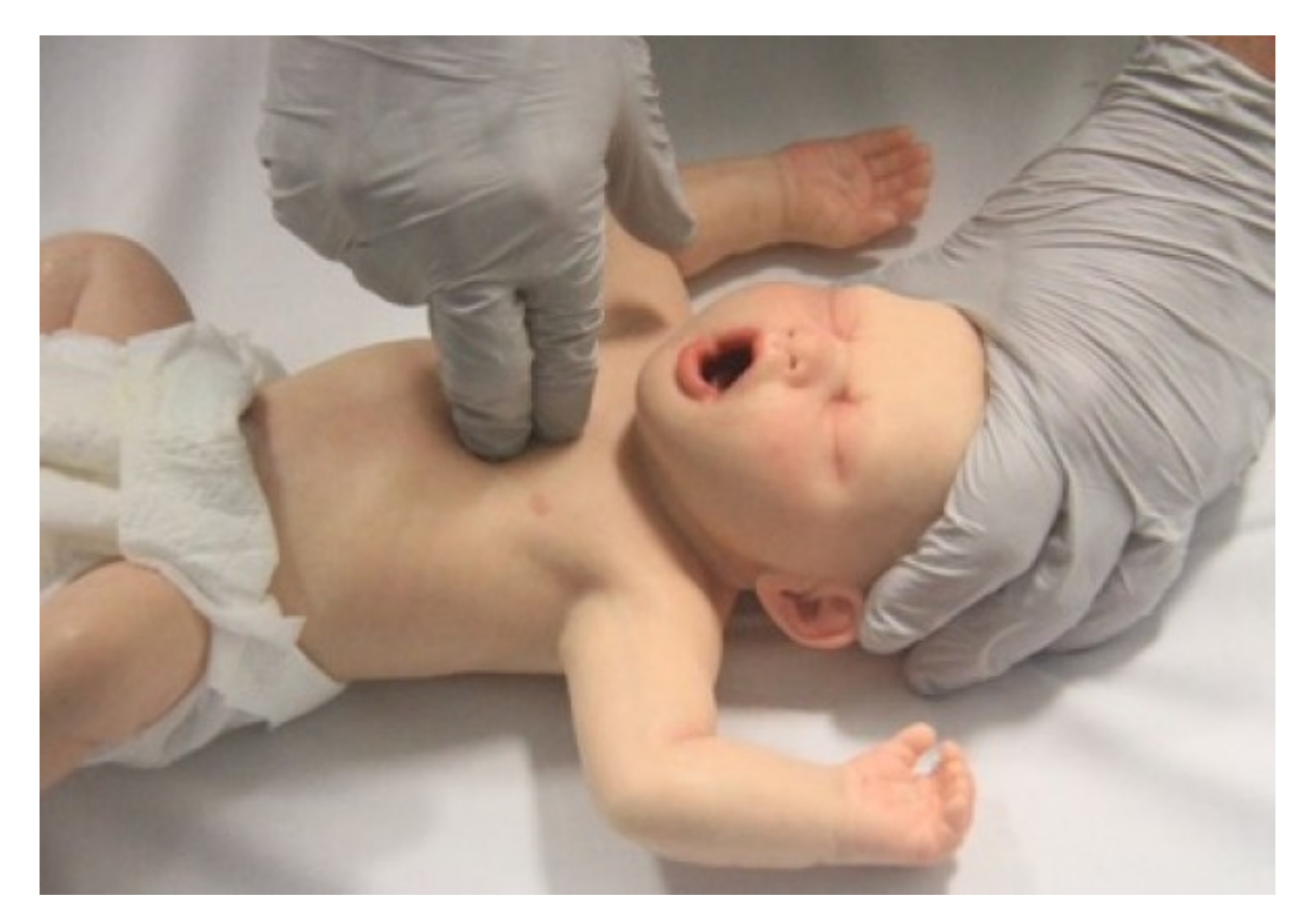
Figure 7: Two-finger technique in infant