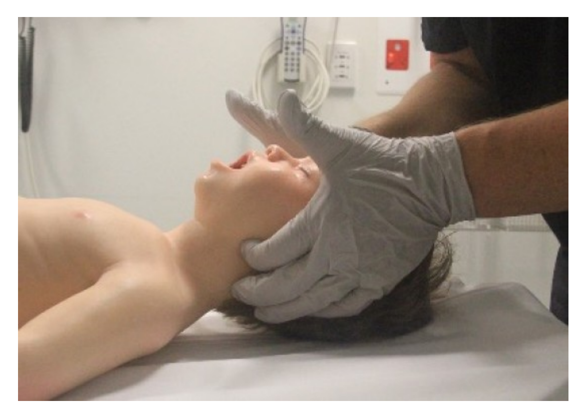
Figure 4: Jaw thrust in a child