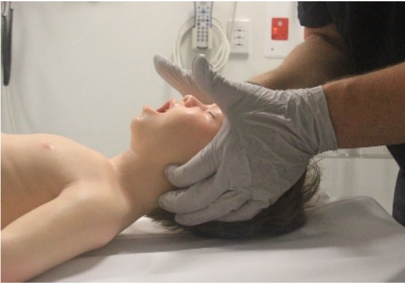
Figure 4: Jaw thrust in a child