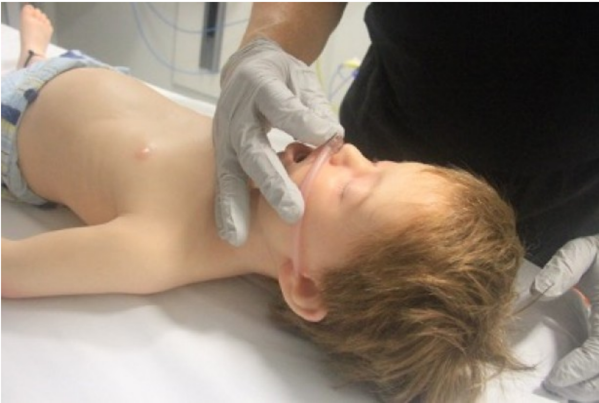
Figure 6: Sizing of naso-pharyngeal tube