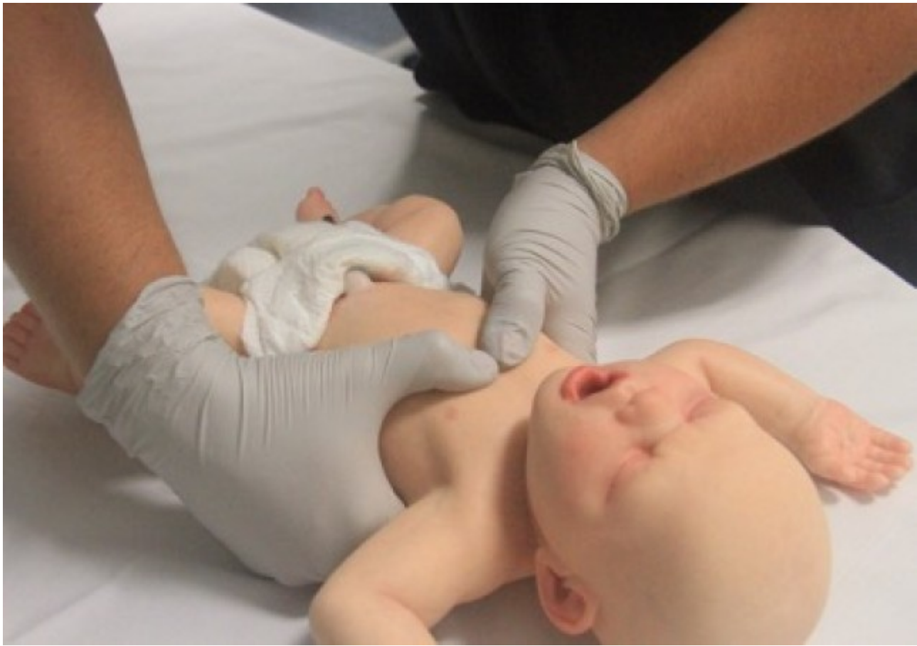
Figure 8: Two-thumb compression technique in an infant