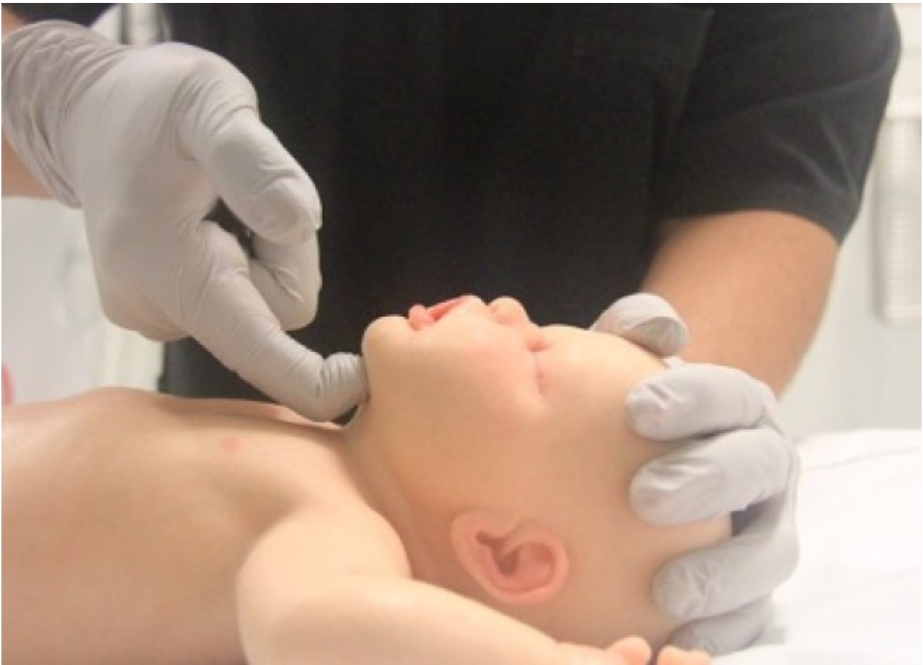
Figure 1: Head tilt with chin lift in an infant (neutral position)