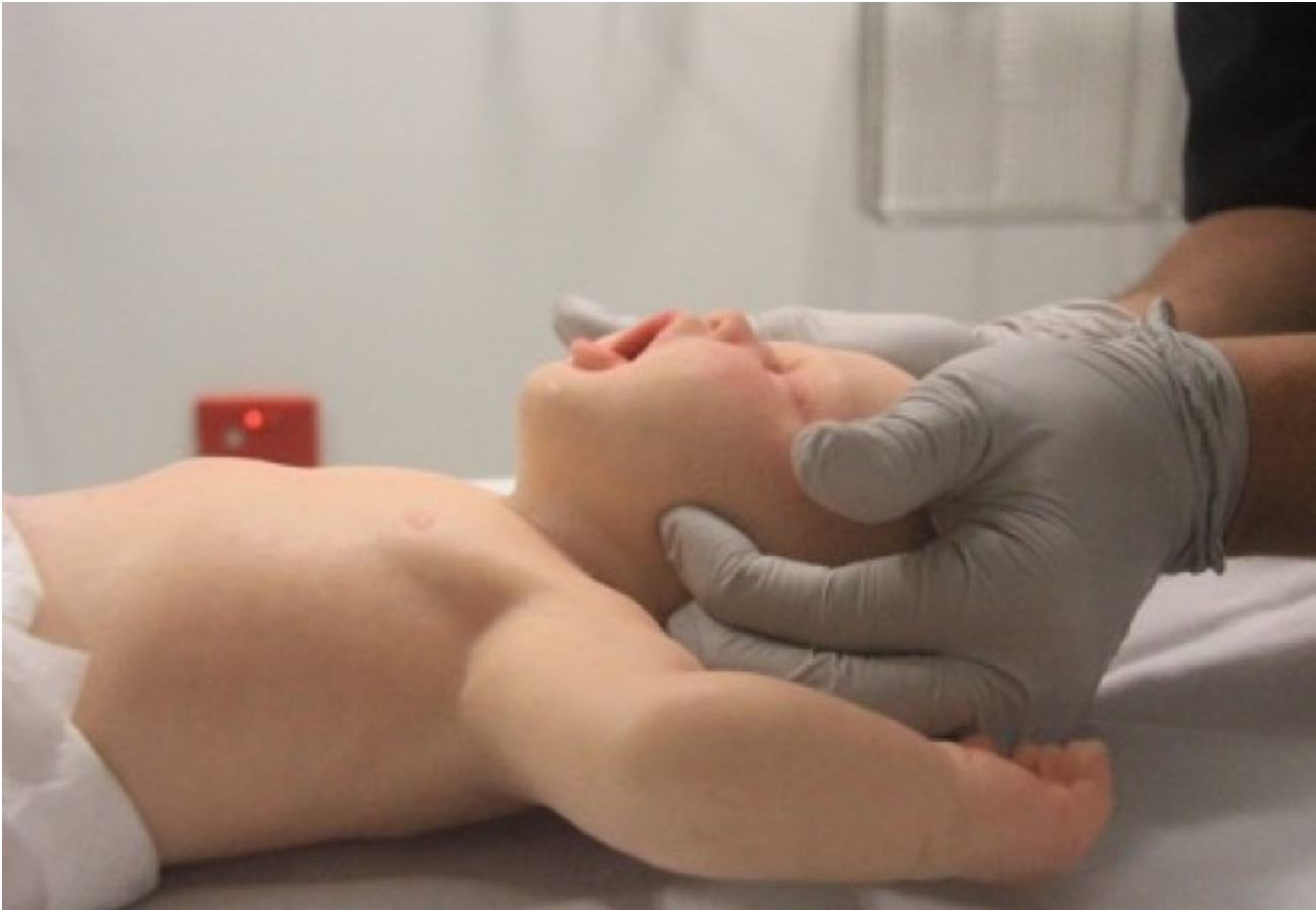
Figure 3: Jaw thrust in an infant