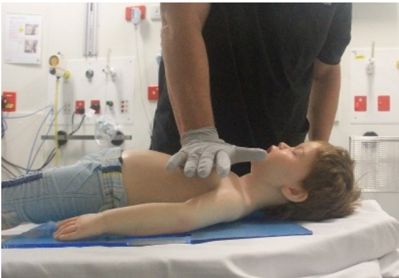
Figure 10: One-handed compression technique in a child

Approximately 50% of a compression cycle should be devoted to compression of the chest and 50% to relaxation to enable full recoil of the chest wall.